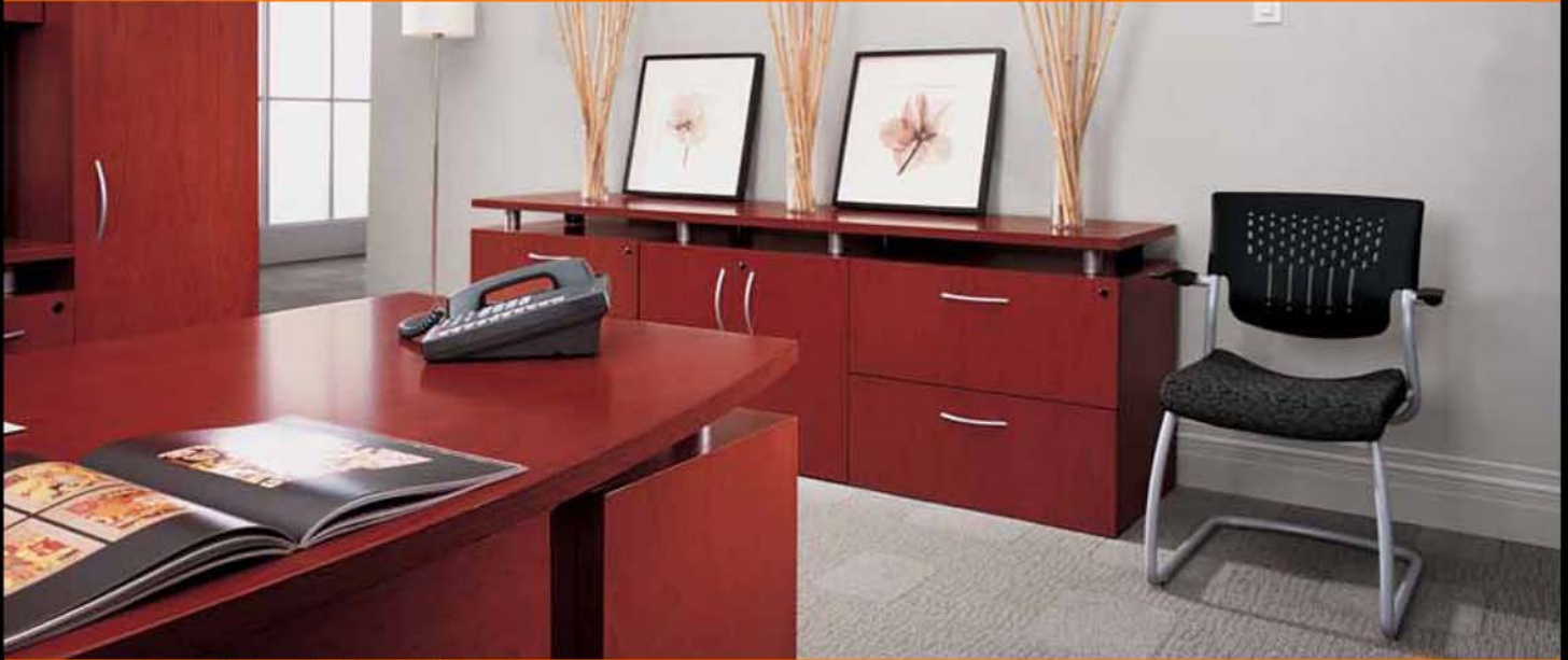
Shown in Red Cherry Wood Veneer with Rest seating