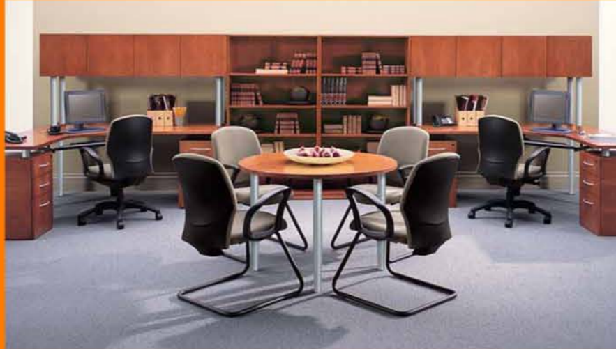
Shown in Warm Cherry Wood Veneer with Duncan seating.