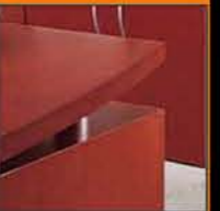
Metal work surface supports create a dramatic floating top appearance. Available in silver or black. (Shown in silver).