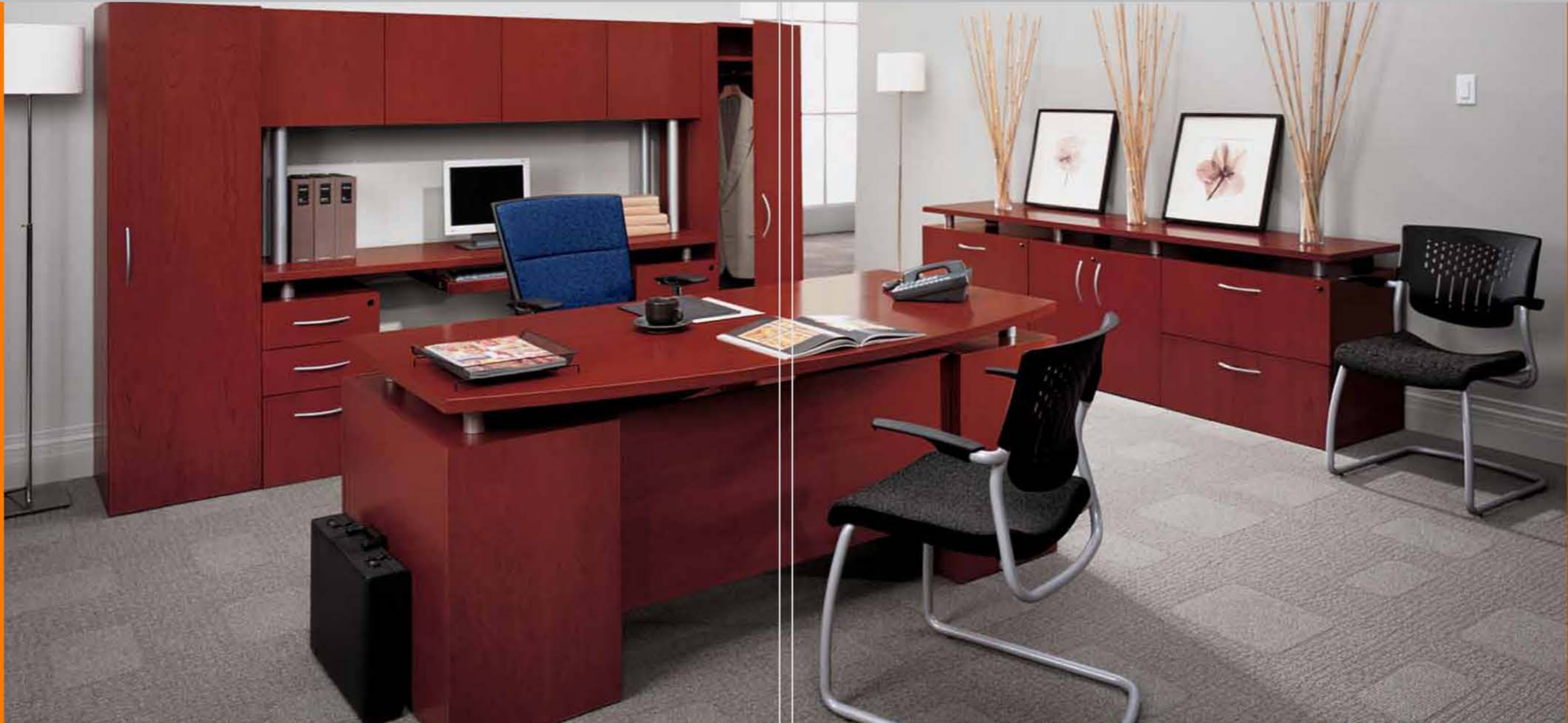
Shown in Dark Cherry Wood Veneer with Ride and Rest seating.

Newland, with its elegant details and sophisticated style creates a prestigious office environment. Pedestal supported worksurfaces offer a dramatic "floating top" appearance that is distinctly unique.