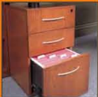
Hanging file rails available for letter and legal filing. Full extension with steel ball bearing progressive slides.