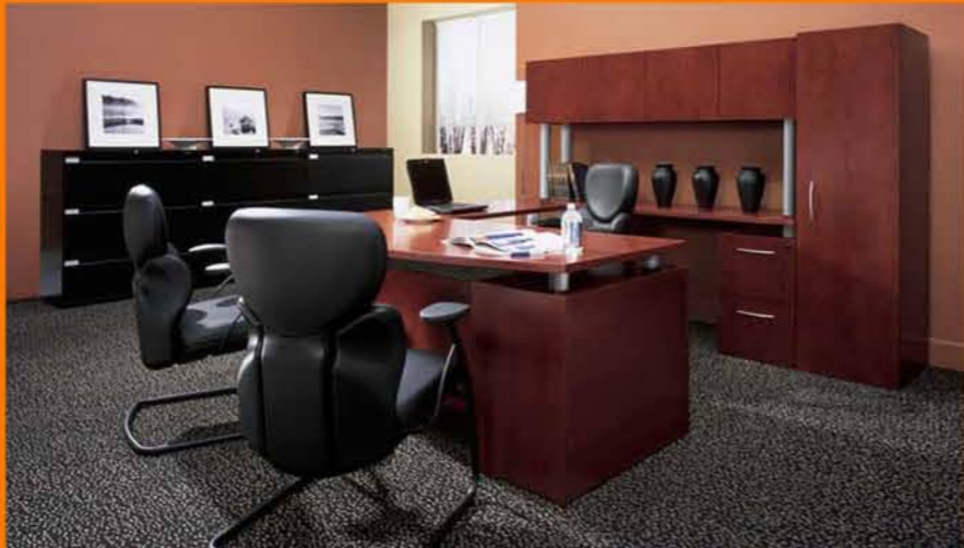
Shows in Dark Cherry Wood Veneer with NuCAS seating.