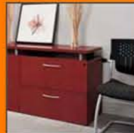
Filing and Storage lateral files and storage cabinets can be combined to create a decorative storage credenza.