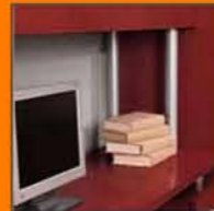
Hutch supported by metal posts available in silver or black. (Shown in silver).

A variety of storage components are available, including hutches, bookcases, wardrobe cabinets and personal towers. Hutches feature four monoposts (silver or black) to attach a 72", 66" or 60" wide work surface and offer optional back panels available in either fabric or veneer. Round or racetrack tops, combined with sleek tapered legs available in silver or black create sophisticated boardroom and meeting tables.