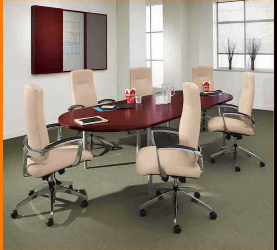
Shown in Dark Cherry Wood Veneer with Karisma seating.

Newland, with its elegant details and sophisticated style creates a prestigious office environment. Pedestal supported workspaces offer a dramatic "floating top" appearance that is distinctly unique.